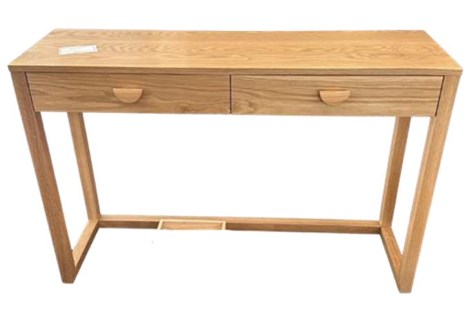
Julia Scott - Custom Design American Oak Hallway Table

Elissa Rich - Custom Design American White Oak & Purple Heart Coffee Table