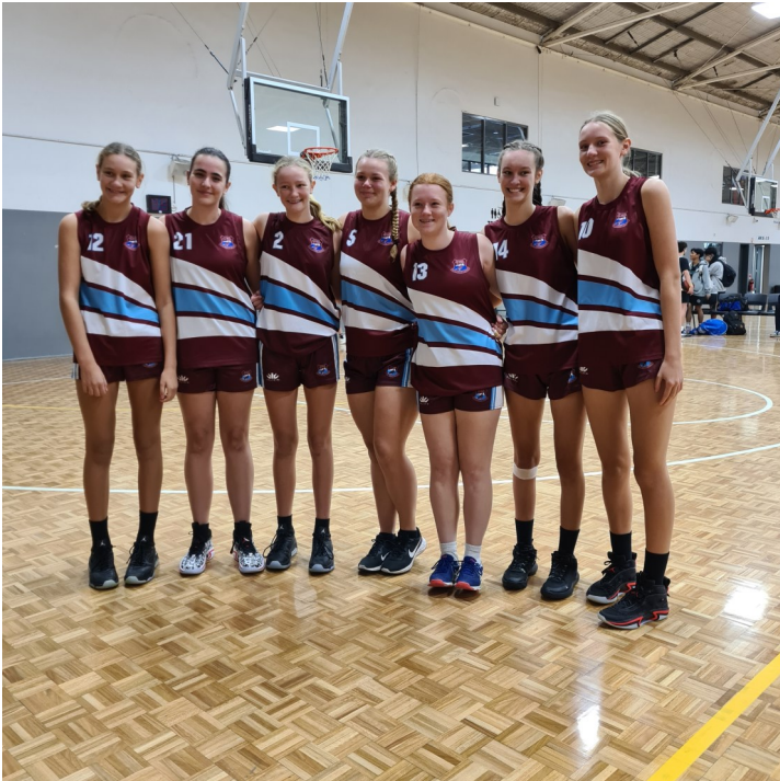
Basketball Final 8