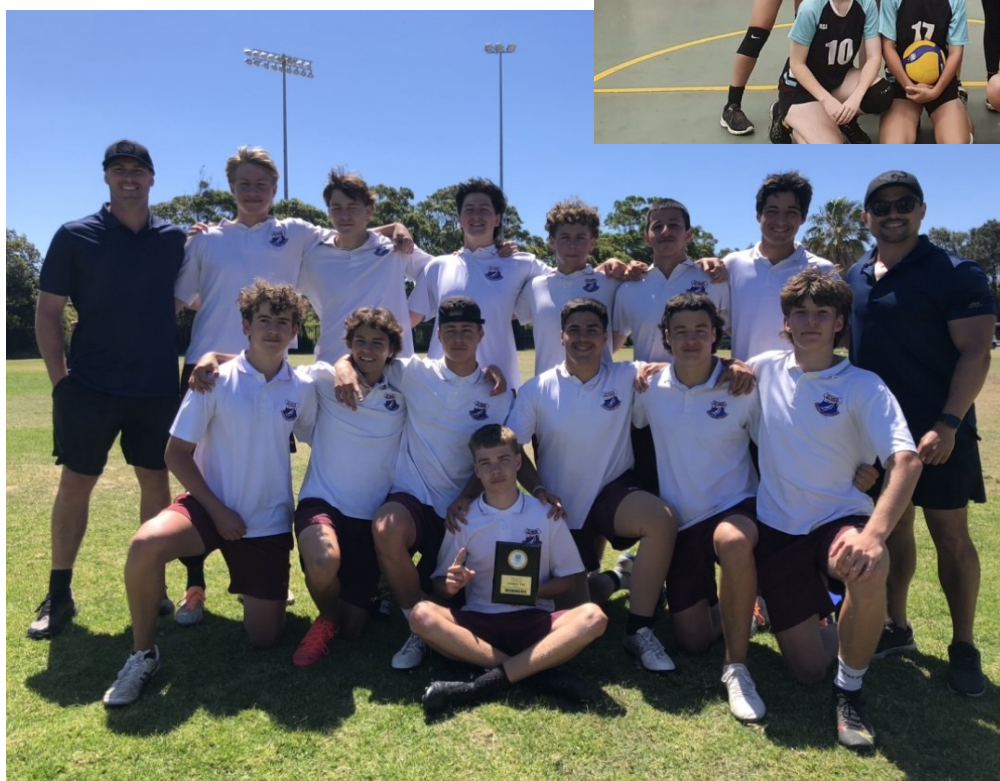
Manly League Tag Winners