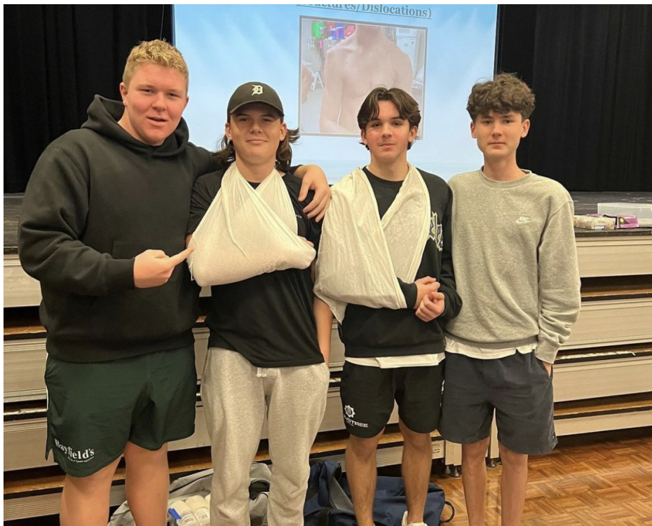
PDHPE First Aid!