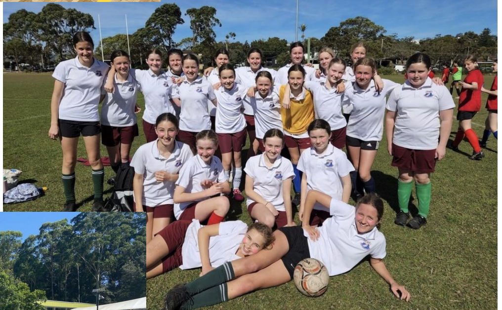
Year 7 Gala Day