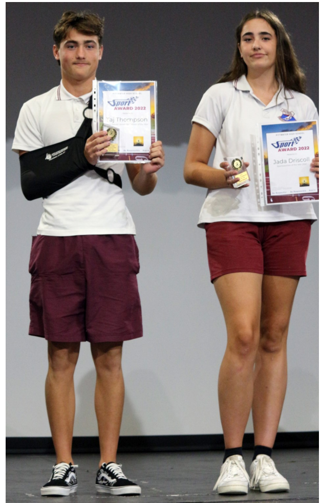
Sportspersons of the Year 2022