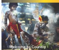
Welcome to Country