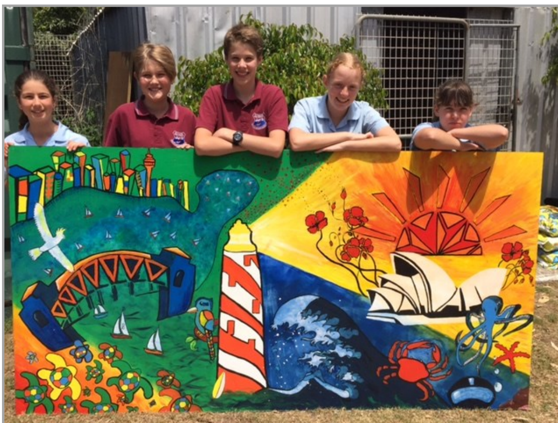
Art club members with the mural