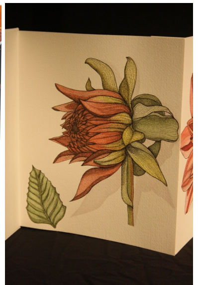
CHELSEA HAGGETT 'A Eulogy for a Flower'