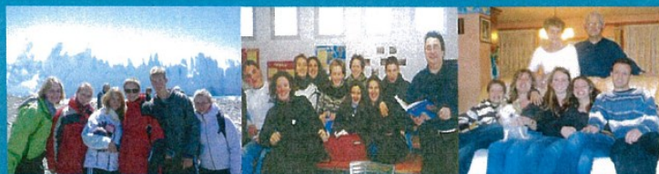
with new friends