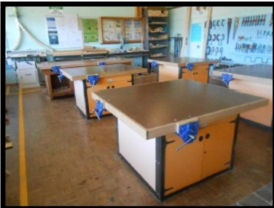
C.Samojlowicz (HT TAS)