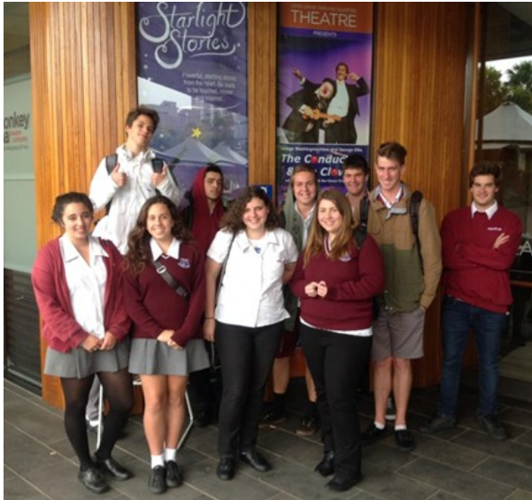
Some of the students outside the theatre!

On Remembrance Day, 11 November, the HSC Modern History class attended a Study Day excursion at the Lend Lease Theatre in Darling Harbour.