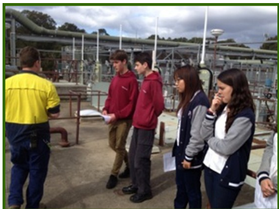
Standing outside the fermentation pits