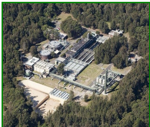
The plant from the air

Our tour began at 2pm, when our group first visited the overflow lagoon; a huge 5,000,000L basin with a floating membrane to prevent odour escaping. This lagoon is an overflow storage system for when the input of the plant exceeds its raw sewage-processing capacity, for instance when there are storm surges. The place we visited was the sewerage screening; where the waste directly from our toilets, showers and sinks is separated into solids and liquids, by means of stepped grilles which catch all the solids. One of the staff said he had found a one hundred dollar note in the screens; we saw a ping pong ball! After the screens, the non-organic solids are taken to landfill. The organic solids go to the digestion tanks to be further broken down, and the water continues to the secondary treatment.