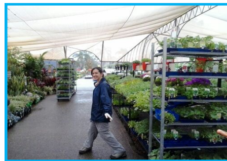
Meret at Flowerpower Nursery

NOTE: Year 10 students who chose a TAFE subject as part of their subject selection for Preliminary/HSC will also need to complete an EOI form and return to me ASAP!